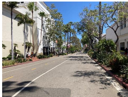
Street: Not a Promenade