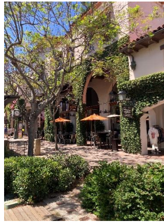
A pedestrian experience

By stripping away any and all standard transportation systems and most traditional events, the city has created a wasteland of scaleless asphalt, occupied primarily by chaotic e-bikes claiming dominance over this pretend promenade. At any given moment, it's clear that, by a wide margin, pedestrians are choosing to enjoy the generous and inviting sidewalk experience.