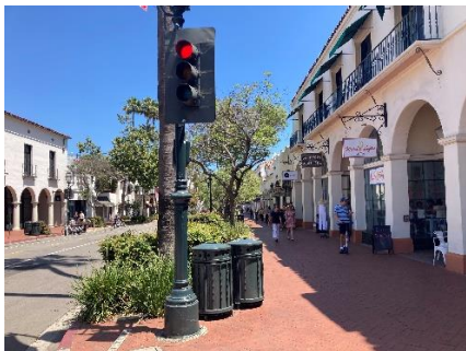
Sidewalk: A Promenade

Characterizing the current condition of State Street, the word that comes to mind is desolate , defined as "a place deserted of people and in a state of bleak and dismal emptiness."